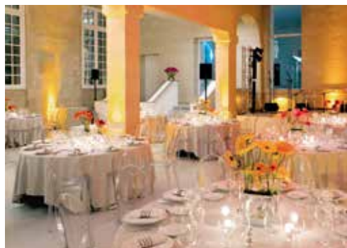
Seated dinner in the Hall des Communs

For an evening event, a gala or your company's anniversary, in the morning or in the afternoon, or for a private visit: the museum offers multiple opportunities for your events. Treat your guests to the opportunity to discover the collection and the exhibitions, in an adapted format that will meet your expectations and conditions for special visits.