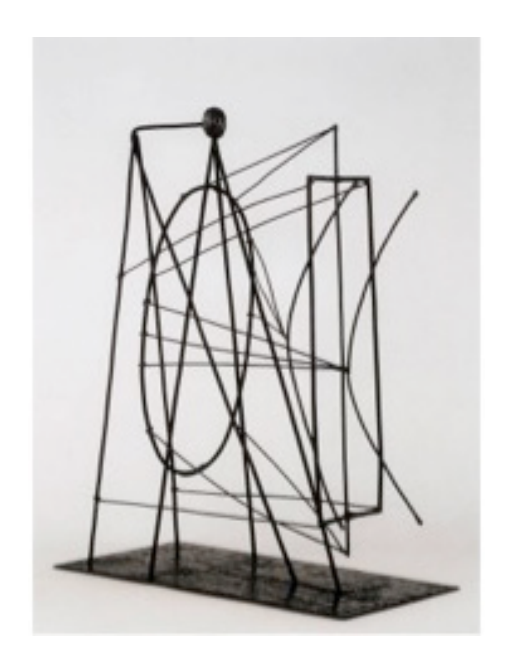
PABLO PICASSO Figure, fall 1928 Iron wire and sheet metal, 50.5 x 18.5 x 40.8 cm Musée National Picasso, Paris. Dation Pablo Picasso. MP264 © Succession Picasso, 2016