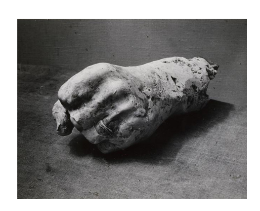
FIG. 5 BRASSAÏ Picasso's "Hand," 1943 épreuve argentique, 12,3 x 17,3 cm Paris, musée national Picasso - Paris.MPPH1996-238