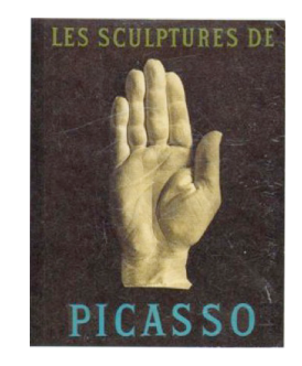
FIG. 4 Couverture des Sculptures de Picasso, Paris, Éditions du Chêne, 1948