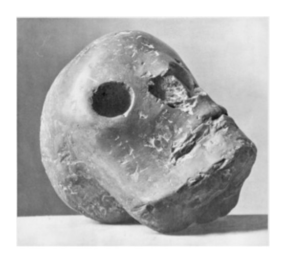
FIG. 3 BRASSAÏ Picasso's "Death's Head," 1943 épreuve gélatino-argentique, 28,5 x 22,2 cm © Succession Picasso, 2016 ©Estate Brassaï