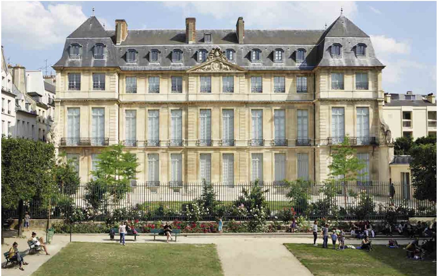
Façade of the Hôtel Salé — Musée national Picasso-Paris