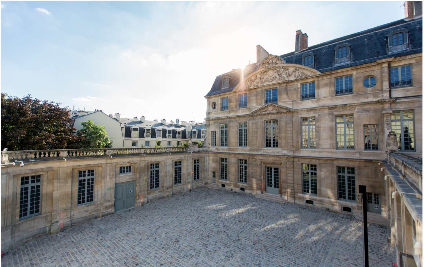
Façade of the Hôtel Salé — Musée national Picasso-Paris