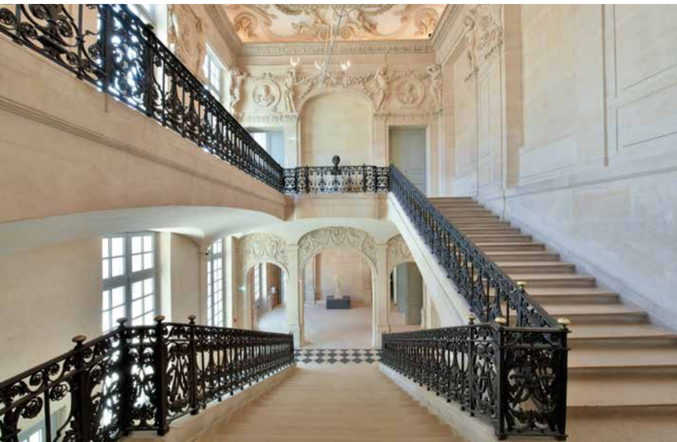
Main staircase and vestibule

Between 2009 and 2014, the building was subject to a renovation, modernization, restoration and extension program, under the supervision of French architect Jean-François Bodin. Reconciling the different languages that form the rich heritage of the museum's original architecture, while magnifying the areas displaying the museum's collections. The renovations have enabled the augmentation of the exhibition areas.