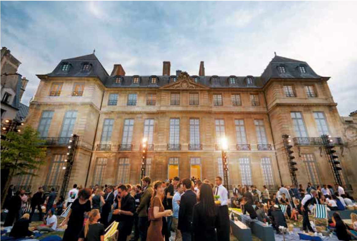
Party in the garden