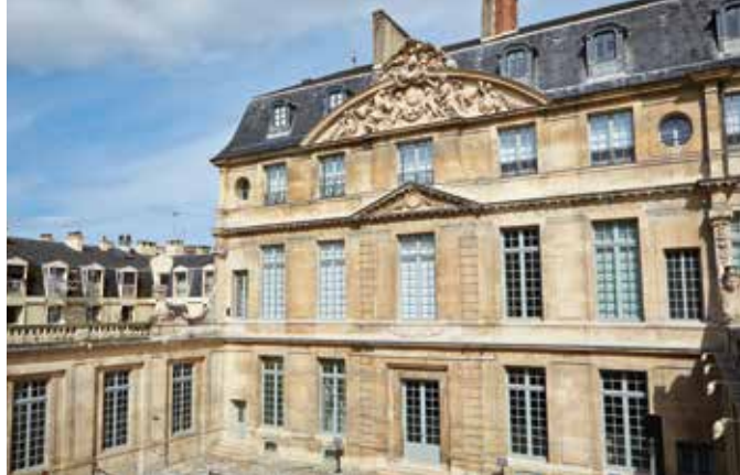
Facade on courtyard of the Hôtel Salé

In the heart of Paris, the Musée national Picasso-Paris offers its spaces for your prestigious events. The Hôtel Salé, one of the most remarkable private mansions of the historic Marais district, provides an exceptional setting for organizing your events.