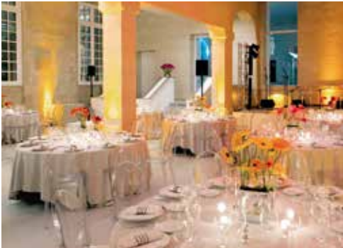
Seated dinner in the Hall des Communs

For an evening event, a gala or your company's anniversary, in the morning or in the afternoon, or for a private visit: the museum offers multiple opportunities for your events. Treat your guests to the opportunity to discover the collection and the exhibitions, in an adapted format that will meet your expectations and conditions for special visits.