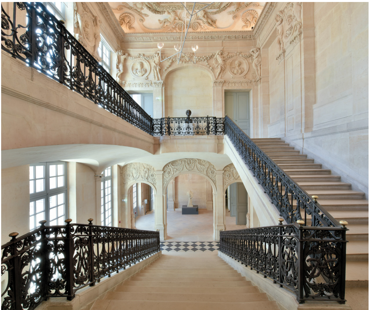
Main staircase and entrance hall

Aubert de Fontenay's beautiful 17th-century town house known as the Hôtel Salé, located rue de Thorigny, is a listed historic monument. It was chosen in 1974 to house the museum dedicated to Picasso's work.