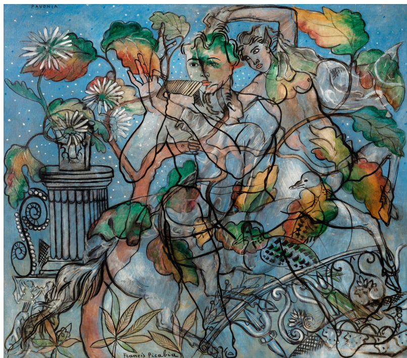
Francis Picabia, Pavonia, 1929