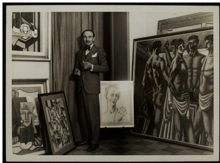
Giorgio de Chirico, "Views of the gallery and various exhibitions(1913-1921)"