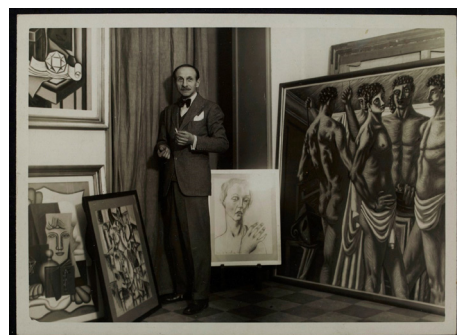
Giorgio de Chirico, "Views of the gallery and various exhibitions (1913-1921)" - reproducing several paintings, including one by de Chirico