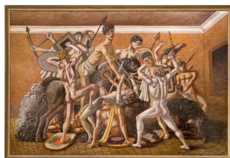
Giorgio de Chirico, Combat , © Adagp, Paris, 2024