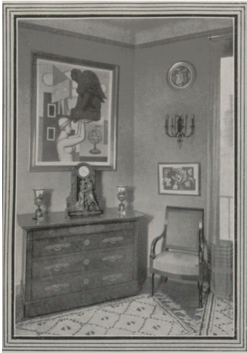
Photo of the flat's Grand Salon with paintings by Jean Metzinger.