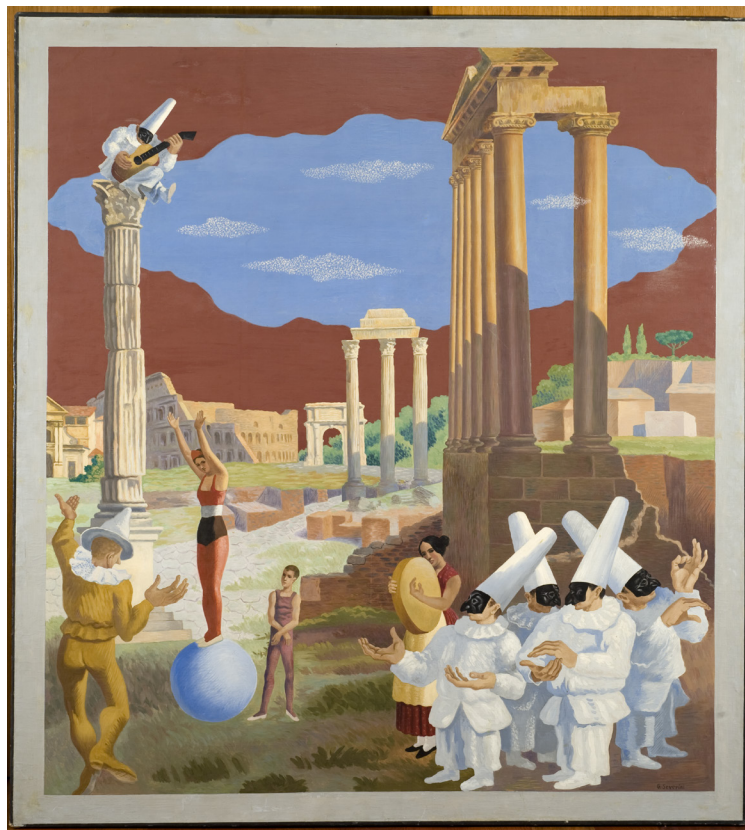
Gino Severini, L'équilibriste , © Adagp, Paris, 2024

Created by the Italian artist Giorgio de Chirico for the reception hall, the large-scale “Gladiators” series comprised a group of eleven canvases painted between 1928 and 1929. These monumental works covered the walls like tapestries. De Chirico focused on the powerful effect of these variations on the warrior nude. On the surface, they evoke the classical, virile grandeur glorified at the time by the Fascist regime. Yet the fallen, limp and effeminate bodies of these gladiators are the opposite of the academic representation of the splendid male nude. The works by Gino Severini, originally intended for Jacqueline’s bedroom, are in this same parodic vein: ancient ruins and commedia dell’arte characters make up seemingly meaningless scenes. This fusion of genres is echoed in the choice of furniture from different periods. With their mixing of styles, these works present a façade of classicism but foreshadow a postmodern approach to art characterised by citation and subversion.