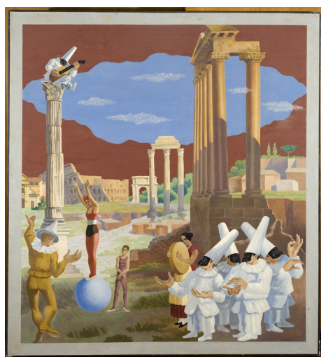
Gino Severini, L'équilibriste , © Adagp, Paris, 2024