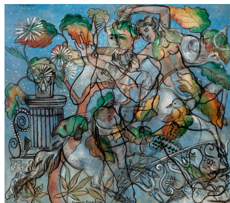
Francis Picabia, Pavonia , 1929, © Adagp, Paris, 2024