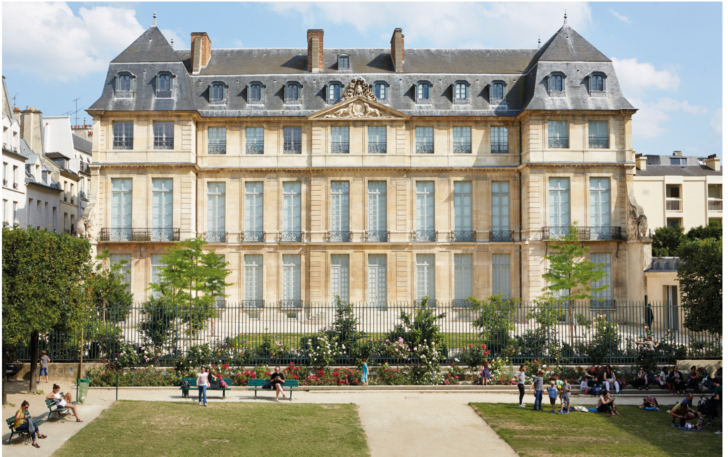
Façade of the Hôtel Salé — Musée national Picasso-Paris