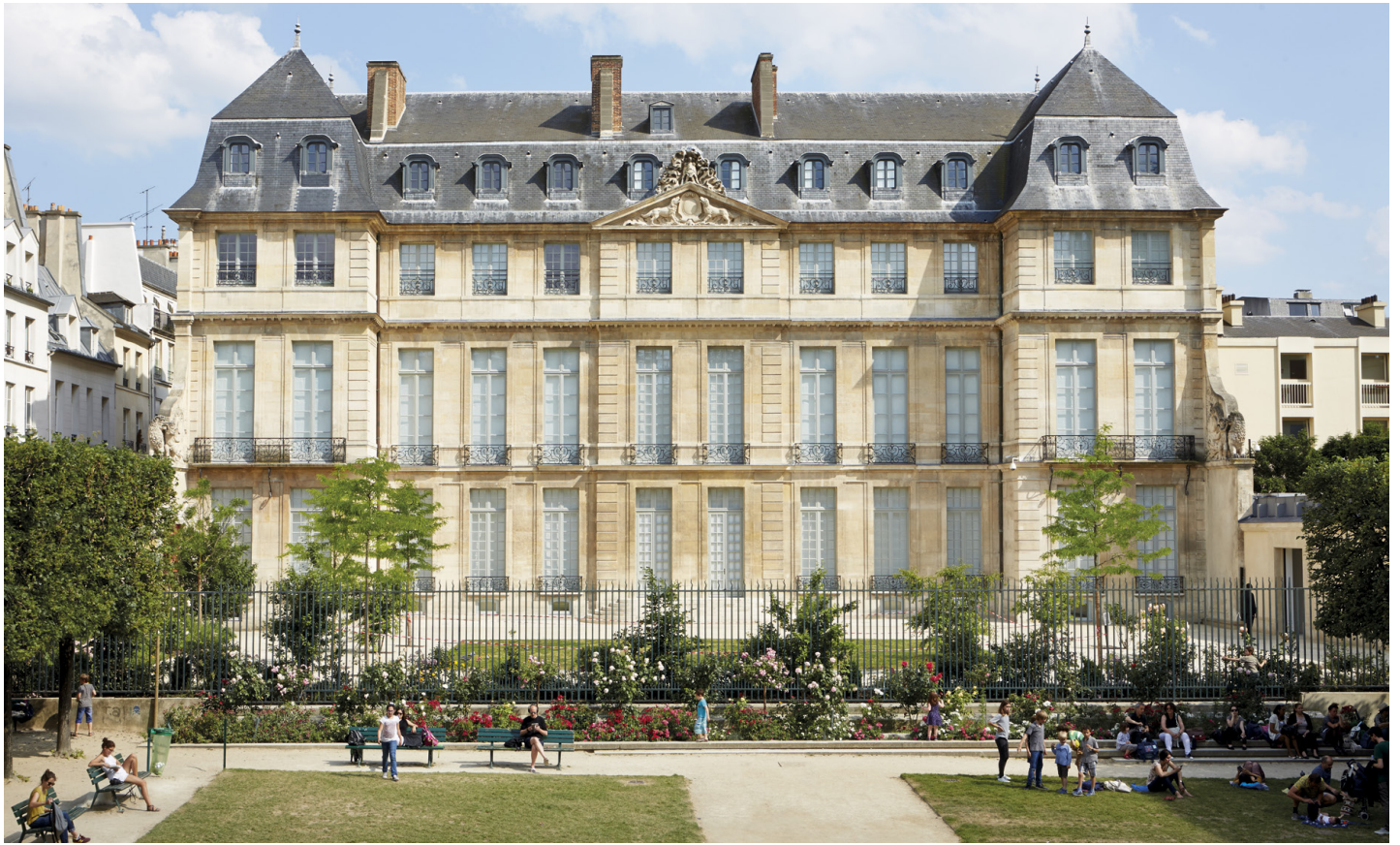
Façade of the Hôtel Salé — Musée national Picasso-Paris