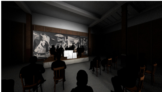
Sequence: The painting's journey to London