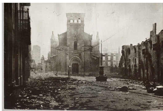
The town of Guernika in ruins after the bombing of 26 April 1937 Paris, Musée national Picasso-Paris