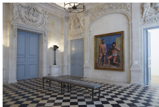
La Flûte de Pan (Pan's Flute), Pablo Picasso, 1923, MP79 © Picasso Estate 2024