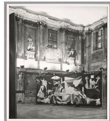
Milan 1953 Perotti Mario (1909–1999) Paris, Musée national Picasso-Paris

January–April 1938: Guernica was then exhibited in Norway, Denmark and Sweden alongside works by modern artists.