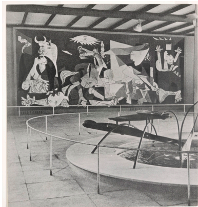
Spanish Republic Pavilion, 1937 Paris, Musée national Picasso-Paris