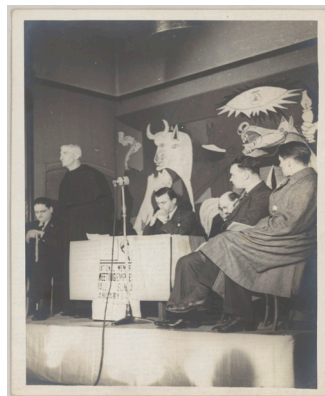
Speech at the conference for aid to Spain in Whitechapel, London, 1938 Paris, Musée national Picasso-Paris