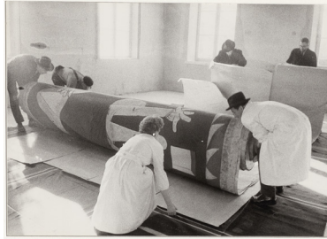
Nationalmuseum, Stockholm, en octobre 1956 Kary H. Lasch ©Musée national Picasso-Paris