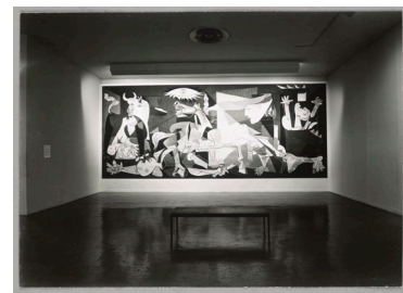
MoMA, New York, 1955 Paris, Musée national Picasso-Paris

1957: Guernica takes part in a new touring exhibition in the United States (New York, Chicago, Philadelphia), before returning to the galleries of MoMA.