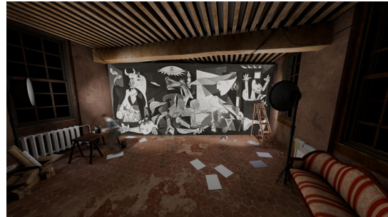
Sequence: Atelier des Grands-Augustins © Lucid Realities, Musée national Picasso-Paris, VIVE Arts 2026