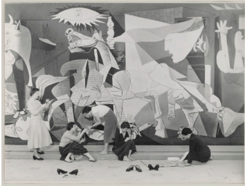
Decorative Arts Paris, 1955 Paris, Musée national Picasso-Paris

1953-1956: In the aftermath of the war, Picasso joined the French Communist Party, publicly committing himself to the cause of peace. Guernica gradually became a symbol of the fight against barbarism. The painting featured in several major retrospectives dedicated to the artist in Milan, São Paulo, Paris, Munich, Cologne, Hamburg, Brussels and Stockholm.