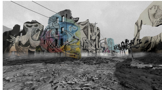
Sequence: the town of Guernica